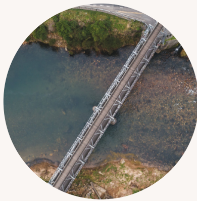
Te Awa River Ride