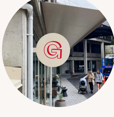
Grey Roasting Co.