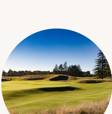
Tieke Golf Estate