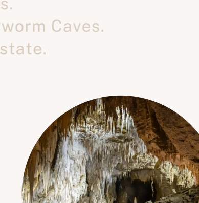
Waitomo Glowworm Caves

Thinking about making Waikato your home? This beautiful region is full of activities and opportunities waiting for you!