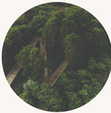
Te Awa River Ride